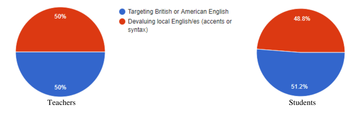
Figure 4. Reasons for perceptions of communicative competence or failure

Question 5: Which one is a reason for ESL/EFL learners' perceived failure as communicatively competent?