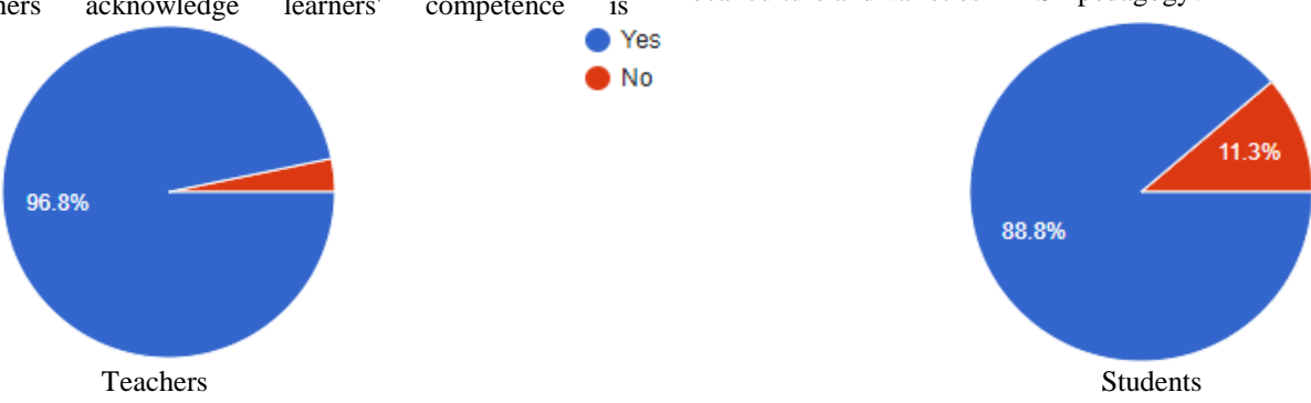
Figure 6. Integration of local variety and culture in ESL pedagogy

Question 7: Should teachers encourage and integrate local culture and varieties in ESL pedagogy?