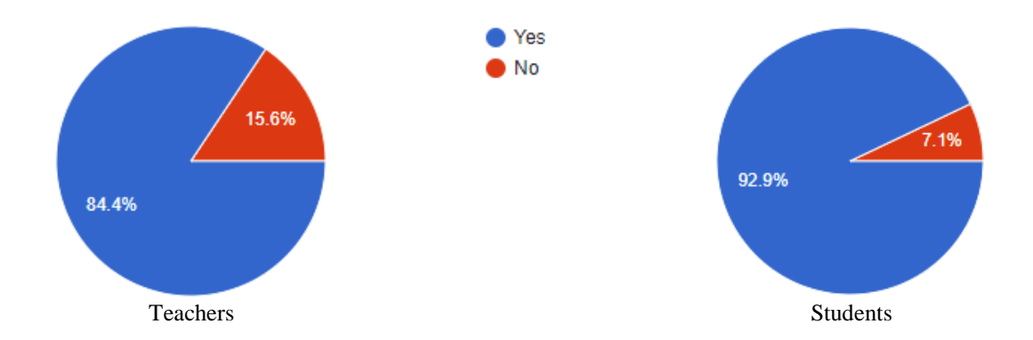
Figure 2. Standard or local variety of teaching/learning

In response to the second question 'Should you aim at teaching any established or standard variety instead of local Englishes?', as shown in Figure 2, a great majority of the teachers (84.4%) replied positive, whereas only 15.6% do not care for such dominant varieties. Almost all (92.9%) students believe in learning a standard variety of English, although 7.1% students intending to learn no particular variety are even fewer than the teachers accepting local English for pedagogical purposes.