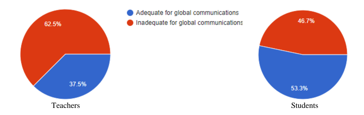
Figure 5. Evaluation of local English varieties

Participating students are divided into two almost equal groups (53.3% - 46.7% as shown in Figure 5) about perceiving own language competence as adequate or inadequate for communicating globally. Again, only 35% teachers acknowledge learners' competence is