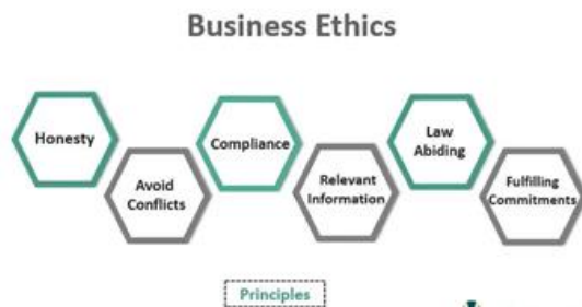
Figure 1. Business Ethics

The coronavirus aggravates another existing frontline work that is an enhancement in the absorptive boundaries factors that exist between non-work and work or problems that it brings aimed at the healthiness labors within effort or non-effort domains [4]. The management practices regarding boundaries depend on the segmentation or integration preferences of organizations as well as individuals. These two preferences deal with the separation and overlapping of work and non-work activities [5]. Nevertheless, during these crucial times, the workplace boundaries become insubstantial whereas its practices have become malleable [6]. For example, telehealth has been used to remotely enable healthcare practices. But such flexibility and ease have reduced the boundary between working and non-working hours and space and also highlight the inequalities that increase one's control over his/her work [7].