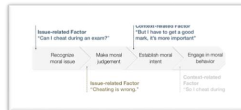
Figure 2. Models of ethical decision making

Ethical education including the debates and roles regarding responsibilities involving ethics must be taught as these are important for digital professionals to know about the critical thoughts, balancing of power, and open sources [8]. Relating to a fairness/cheating field, public which community animals "which attention is prepared within development related to skill in order to stay extremely critical for evidencing that related to deceit or assistance, plus for reacting beside feelings which induce them for playing "tit for tat", required benefit via individuals who required to understand the following transfer utilizing his/her overall intelligence" [8].