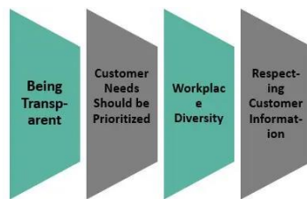
Figure 3. Example of business ethic

It is important for the consumers of the e-commerce market to build a strong trust relationship in order to process the payments and order successfully and effectively. This will help them in gaining accurate output while their privacy will be maintained. It is also important for them to rely on the mechanisms that govern the endorsements and feedback system of vendors because it works for the best interest of consumers as these are free from any scheme or exploitation.