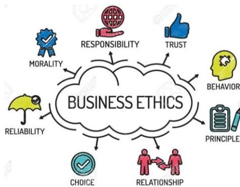
Figure 5. Forms of business ethic

Comparably, an educational domain may also use VR in various ways. It already has various applications in fields of simulation training, social sciences, and humanities [35]. Observing the history through historical empathy is a great example of enhancing effectiveness in the learning process as it assists in bringing the geography distant individuals and communities in close proximity to students so they can properly understand it [36].