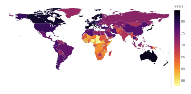
Figure 3. Life expectation by country (Source: Kaggle / WORLD DATA by country (2020).

Figure 3 allows us to assess at a glance countries with the highest rate of life expectancy. Analyzing an Excel file is much faster by visualization, especially if the data is large and complex.