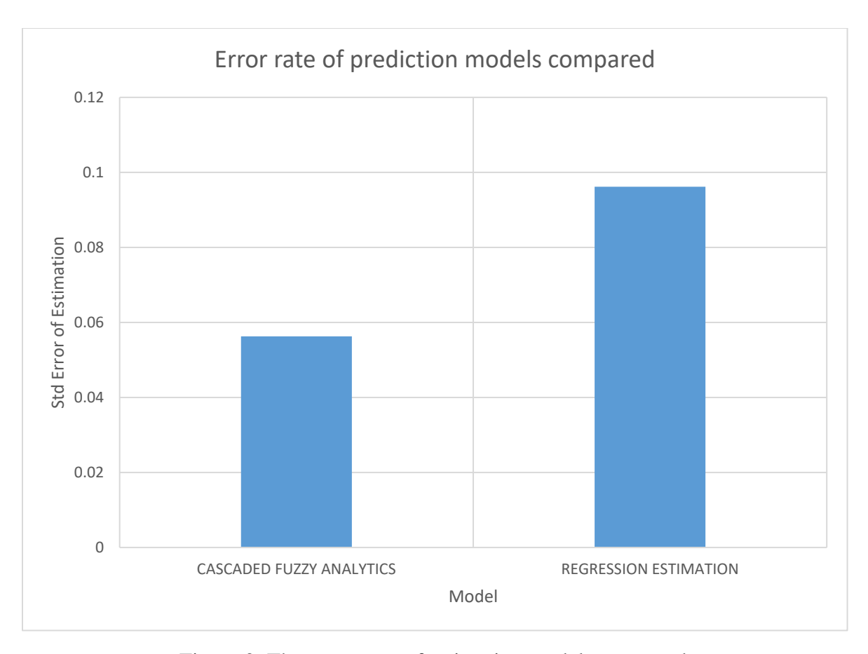
Figure 3: The error rates of estimation models compared.