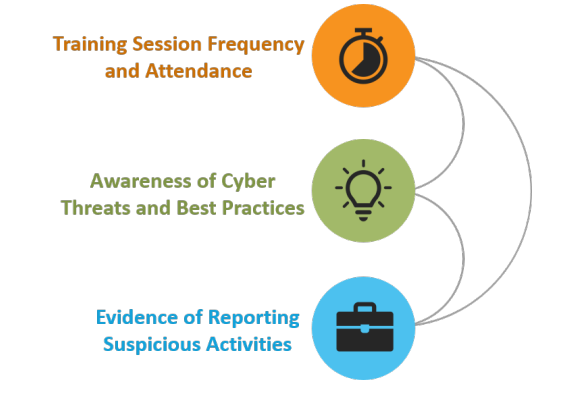
Figure 4. Employee Training and Awareness Indicators

This crucial stage recognizes the pivotal role that wellinformed and vigilant employees play in bolstering an organization's overall cyber resilience. To achieve this, three key indicators have been identified, each aimed at cultivating a cybersecurity-aware workforce capable of mitigating risks effectively, as shown in Figure 4.