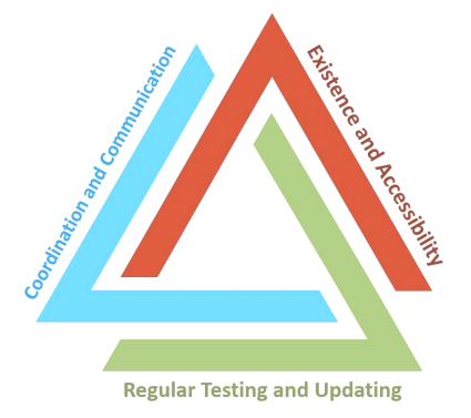
Figure 5. Incident Response Plan Indicators

Advancing into the fifth stage of the proposed cyber resilience framework, the focus turns to the development and implementation of an Incident Response Plan (IRP). This stage is dedicated to preparing the organization for effective responses in the event of a cybersecurity incident. Three key indicators have been identified to ensure the organization is well-equipped to detect, respond to, and recover from incidents, as shown in Figure 5.