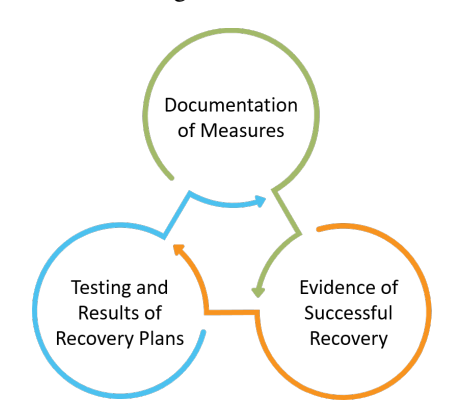
Figure 6. Business Continuity and Disaster Recovery Indicators

Entering the sixth stage of the proposed cyber resilience framework, the focus shifts to Business Continuity and Disaster Recovery—a critical aspect ensuring the organization's ability to maintain essential functions in the face of disruptions. Three key indicators have been identified to establish and evaluate the organization's preparedness for sustaining operations during and after a cybersecurity incident, as shown in Figure 6.