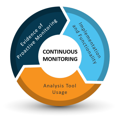
Figure 9. Continuous Monitoring Indicators

Implementation and Functionality: At the core of continuous monitoring is the implementation and functionality of systems designed to track and analyze the organization's digital environment continuously [9]. This indicator emphasizes the importance of having robust and effective continuous monitoring solutions in place. These systems should encompass a wide range of assets, including net-