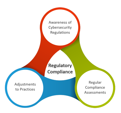
Figure 10. Regulatory Compliance Indicators

This stage emphasizes the importance of aligning cybersecurity practices with applicable regulations to ensure legal and regulatory obligations are met. Three key indicators have been identified to assess the organization's commitment to regulatory compliance, as shown in Figure 10.