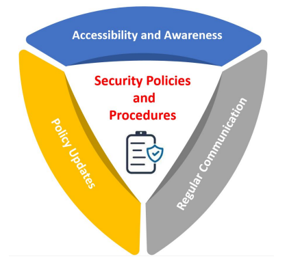
Figure 3. Security Policies and Procedures Indicators

Advancing into the third stage of the proposed framework for cyber resilience, the focus now turns to Security Policies and Procedures—a crucial aspect in promoting a culture of cybersecurity within the organization. This stage is dedicated to the formulation, communication, and maintenance of comprehensive policies and procedures designed to safeguard against cyber threats. Three key indicators have been identified to fortify the organization's ability to establish and maintain effective security policies and procedures, as shown in Figure 3.