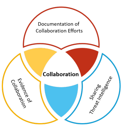
Figure 8. Collaboration with Stakeholders Indicators

Entering the eighth stage of the proposed cyber resilience framework, the focus now expands to Collaboration with Stakeholders—a critical component in enhancing the collective ability to detect, prevent, and respond to cybersecurity threats. This stage emphasizes the importance of forging partnerships and sharing information with external entities to fortify the organization's cyber resilience. Three key indicators have been identified to assess the effectiveness of collaboration efforts, as shown in Figure 8.