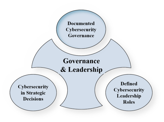
Figure 1. Governance and Leadership Indicators

A meticulously documented set of cybersecurity governance policies provides a roadmap for the organization,