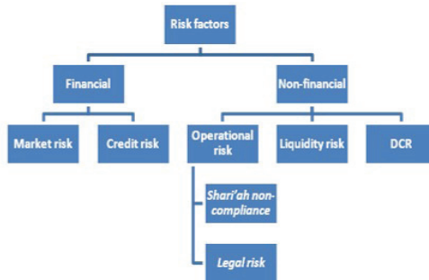
Figure 1 Risk factors DCR- displaced commercial risk

5.1. Market risk is the risk that changes in financial market prices and rates will reduce the value of a security or a portfolio; which includes: equity price risk, interest rate risk, foreign exchange risk and commodity price risk.