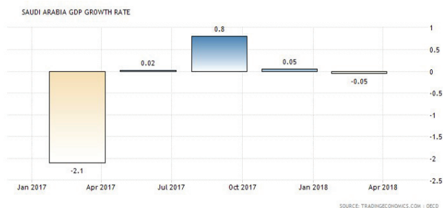
Figure 3 Saudi Arabia GDP Growth Rate

As shown from the data in Table 1, the default loan rate in 3 years period is growing rapidly. This requires the bank to include in its robust stress testing in asset quality a test based on default loans as a whole. Usually the probability of default can depend on the health of the economy, in addition to company-specific balance sheet considerations. The default rate increased significantly in the second half of 2017. At the same time the macroeconomic data for Saudi Arabia shows a slighter growth in GDP in the second half of 2017 (Diagram 3). As well, the oil prices during 2017 showed growth in comparison to the previous year. We believe that if Alinma bank implements blockchain and smart contracts would help to discover earlier such a negative tendency and sufficiently reduce it by taking appropriate measures.